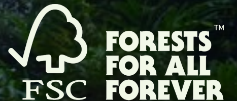
Photo: Tropical forest of Deramakot